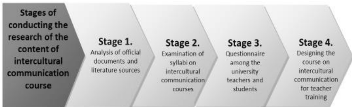
Fig.1. Stages of conducting the research

At the first stage we applied the qualitative method to study the national and world official document that proved the relevance of the issue of introducing the intercultural communication studies into the curricula of teacher training. At this stage we analysed in details the literature and research papers for providing theoretical context of the current study. We paid particular attention to the literature that highlighted the context and approaches of teaching intercultural communication with a particular focus on searching for the topics that were included into the course content. At the second stage we examined the syllabi of intercultural communication courses from different universities all over the world (approximately 10 syllabi) as syllabi demonstrated the lecturer's concern of what should be taught and how the intercultural communication should be taught (Yueh & Copeland, 2015). It was also important to define the balance between theory and practice in the intercultural communication course. At the third stage the questionnaire was held among the university teachers and students to understand of how aware of intercultural communication issues they were and what topics should be included in the course content. At the fourth stage we designed the syllabus of the intercultural communication course for teacher training, based on the methodological choices, documents, findings and research results.